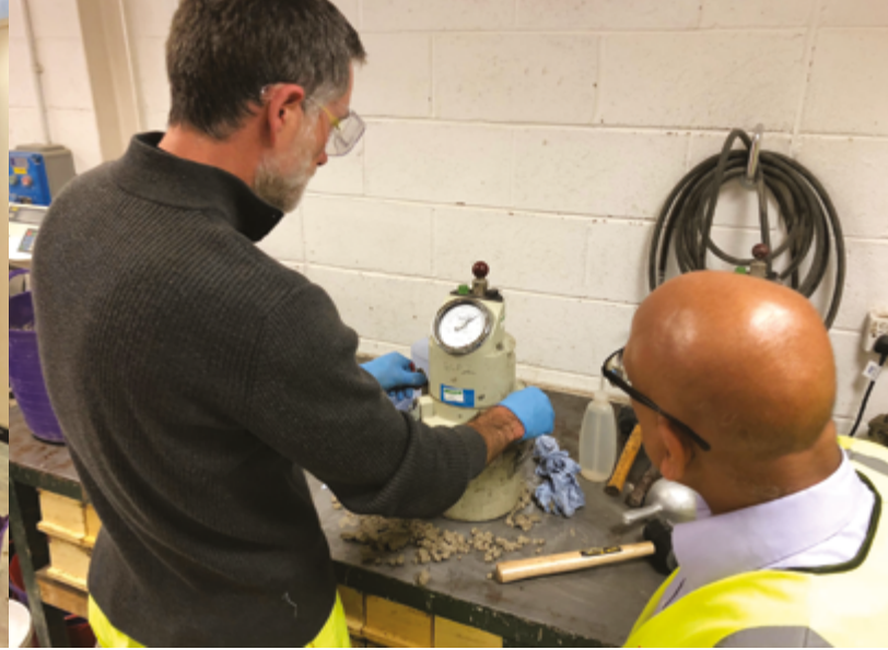
Air content test in progress.

Part 2 – Slump-test ; Part 5 – Flow table test ; Part 6 – Density ; Part 7 – Air content ; Part 8 – Self-compacting concrete . Slump-flow test ; and EN 12390 Part 2 – Making and curing specimens for strength tests (2) . This will be applicable in the parts of the globe that use ENs rather than ASTMs, but to an internationally recognised standard of competence. Such an extension to ENs has not been available before.