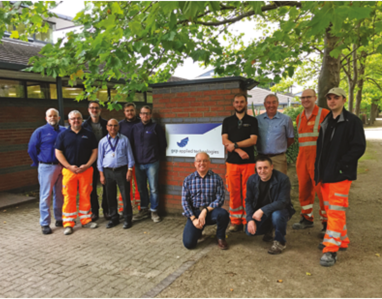
Participants in a preliminary session held at GCP Applied Technologies' premises.